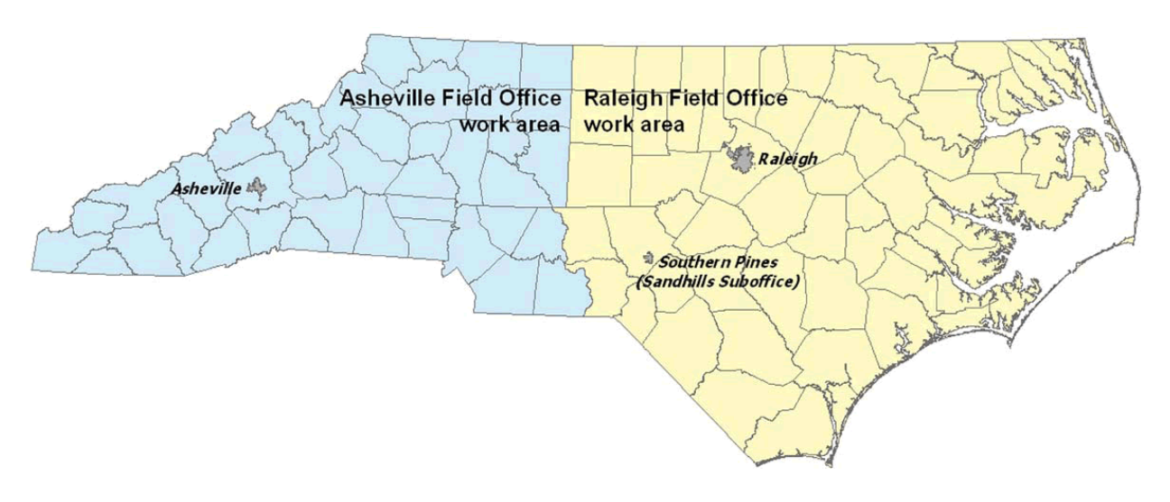
Asheville U.S. Fish and Wildlife Service Office counties: All counties west of and including Anson, Stanly, Davidson, Forsythe and Stokes Counties.

Below is a map of the USFWS Field Office Boundaries: